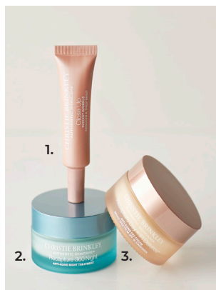
1. Close Up Instant Wrinkle Reducer Treatment 2. Recapture 360 Night Anti-Aging Treatment 3. Recapture Day + IR Defense Day Cream

A: The second your heater goes on you need to drink more water! It is very important for your skin. After exfoliating I use my PURE RADIANCE Illumination Facial Oil. Once the oils sink in, I then use the RECAPTURE 360 + IR Defense Anti-Aging Day Cream and my skin feels great all day long. I use the PURE RADIANCE Illumination Facial Oil again in the evening before applying my RECAPTURE 360 Night Anti-Aging Night Treatment. And drink another bottle of water!