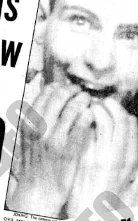
JOKING: The camera civil servant in night with...