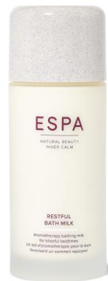
Restful Bath Milk 200ml / RRP £30