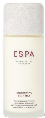
Restorative Bath Milk 200ml / RRP £30