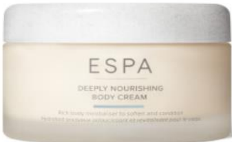
Deeply Nourishing Body Cream