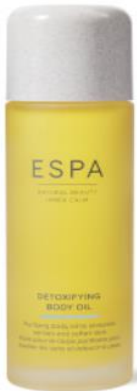
Detoxifying Body Oil