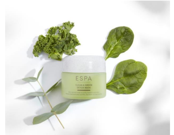
Clean & Green Detox Mask