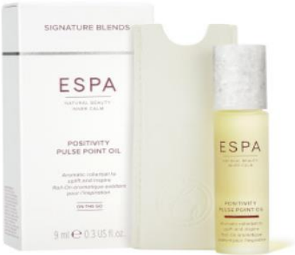
Positivity Pulse Point Oil