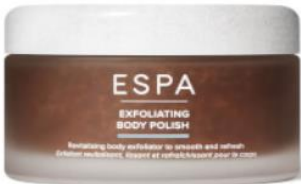
Exfoliating Body Polish - Jar