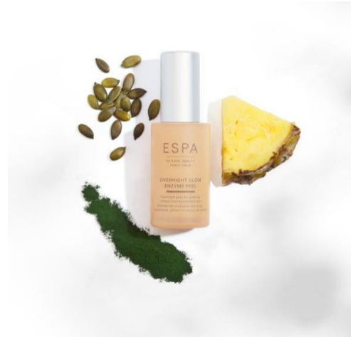
Overnight Glow Enzyme Peel