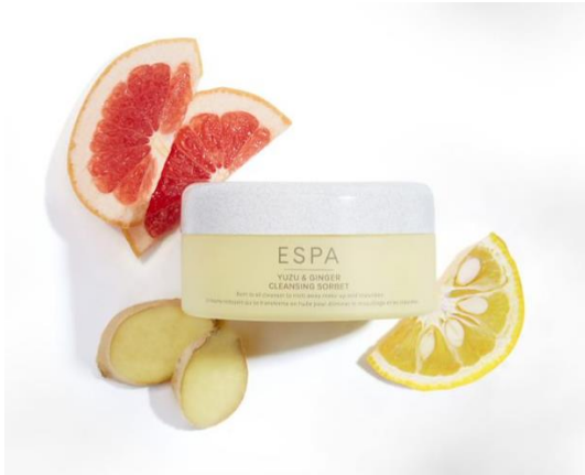
Yuzu & Ginger Cleansing Sorbet