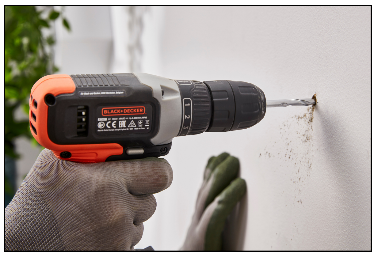
4) Once more, check for any cables. Now, grab your electric drill and drill your holes slightly deeper than the wall plugs. If you're going into brickwork, you might want to use the hammer action on your drill.