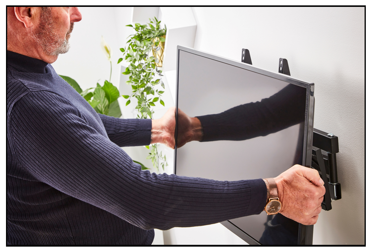
8) Finally, carefully lower your TV onto the bracket, ensuring it's secured in place. And that's it, job done — happy viewing!