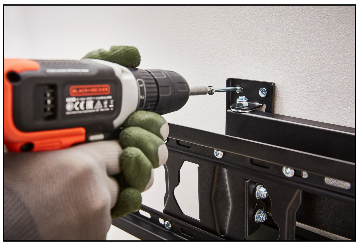
6) Next, place the bracket on the wall and fix the screws into place.