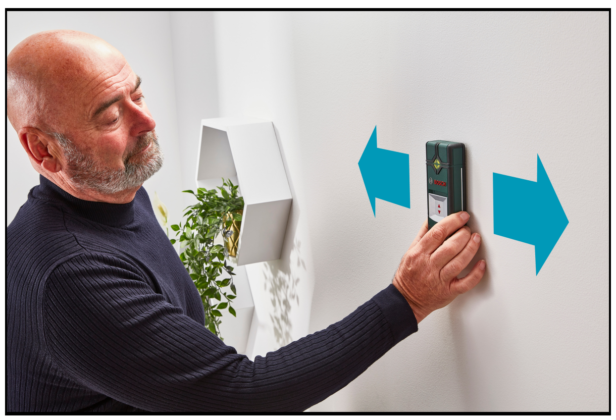
1) Use a detector to check for any pipes or cables where you wish to hang your Flat Screen TV.