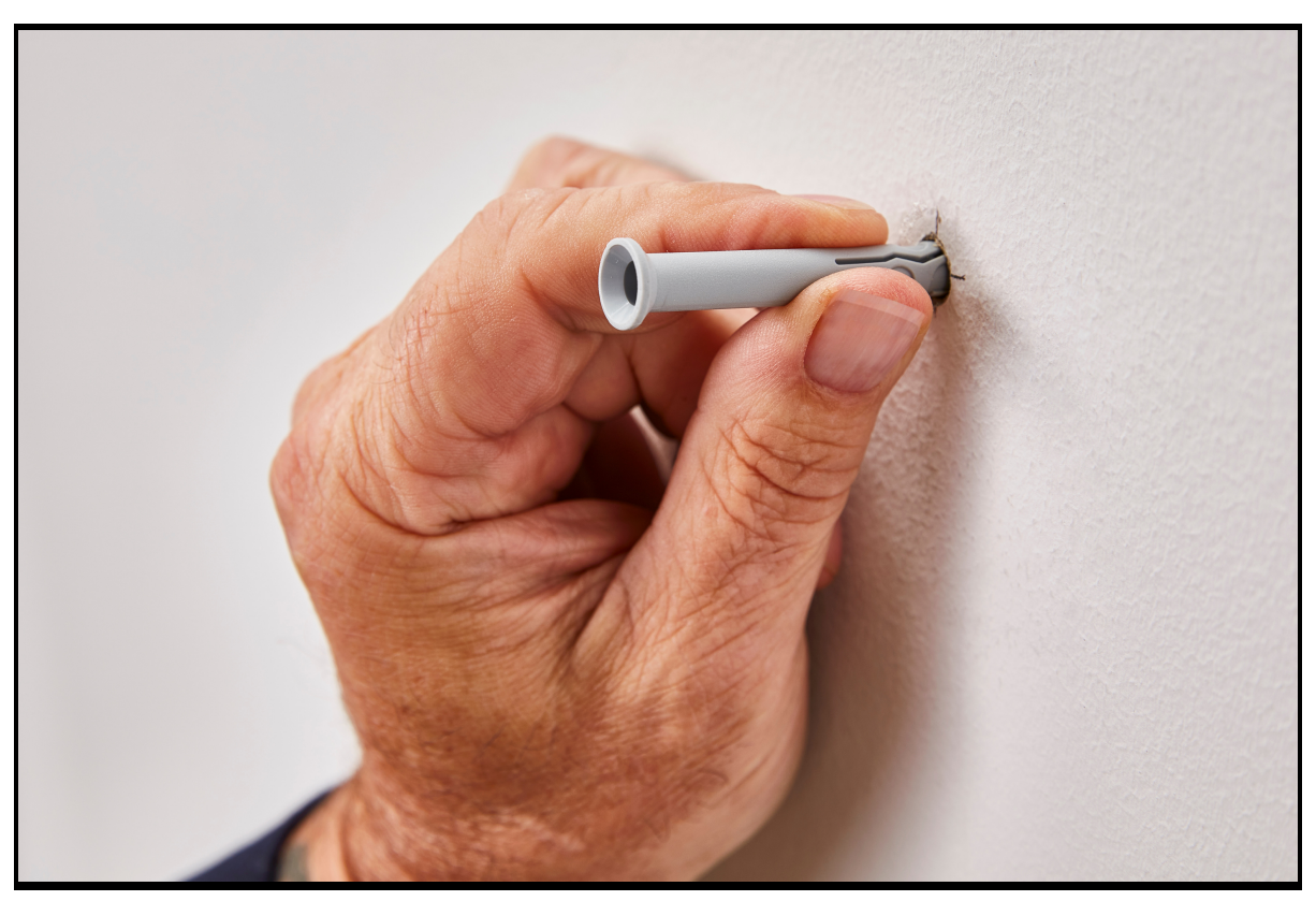
5) Insert the wall plugs so that they're flush with the wall. Give them a light tap with a hammer, if required.