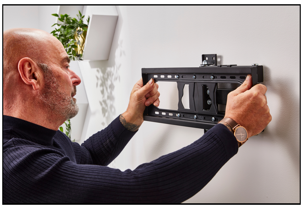
2) Place the TV mounting bracket on the wall where you wish to hang your TV, ensuring the bracket is at the correct height.