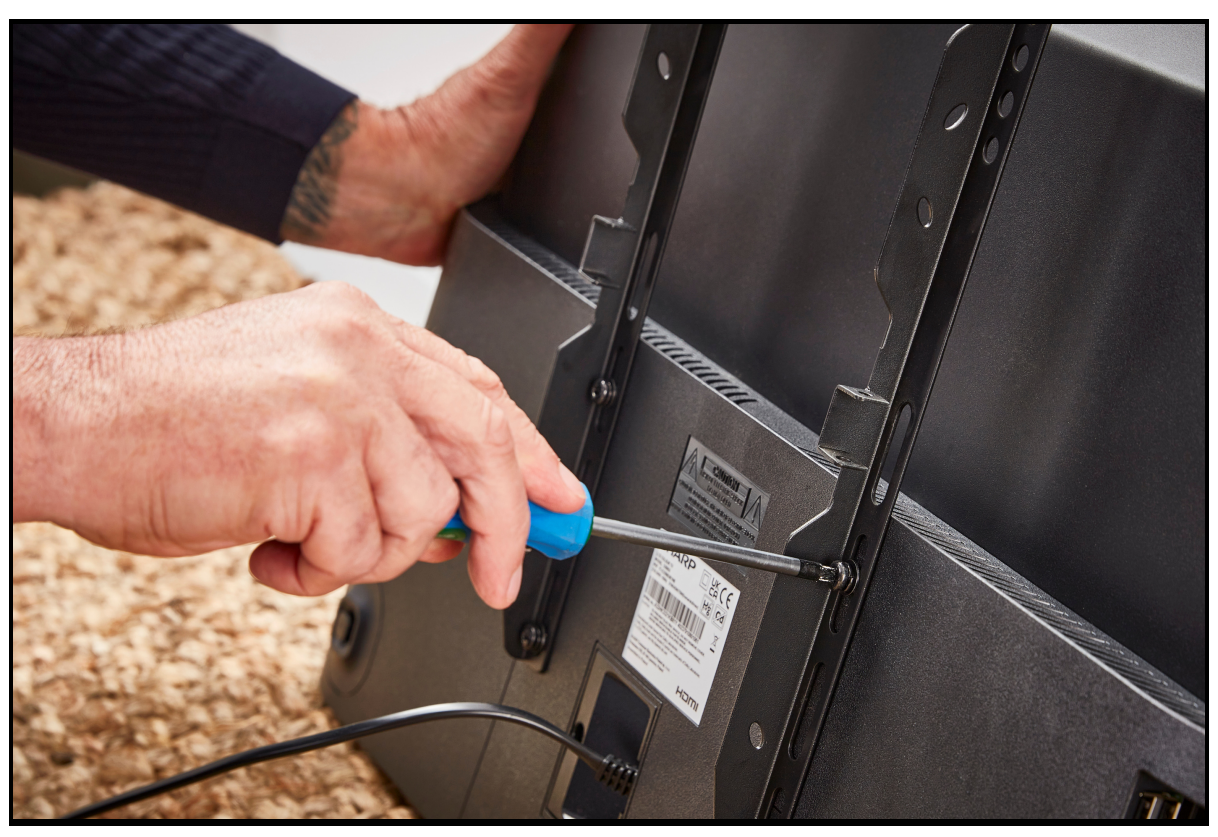
7) Fix the connector plates to the back of the TV.