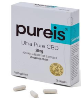
CBD Capsules advanced absorption 20mg 28s