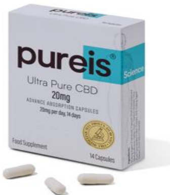
CBD Capsules advanced absorption 20mg 14s