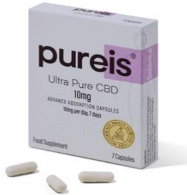
CBD Capsules advanced absorption 10mg 7s