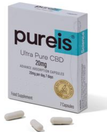
CBD Capsules advanced absorption 20mg 7s