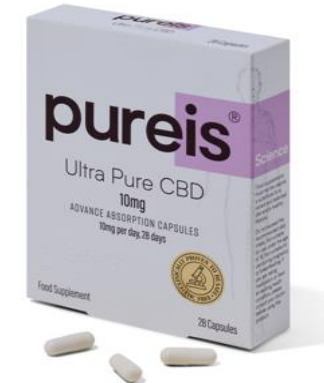
CBD Capsules advanced absorption 10mg 28s