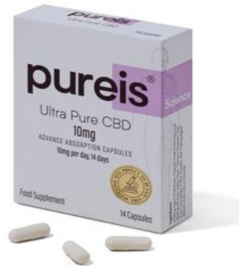
CBD Capsules advanced absorption 10mg 14s