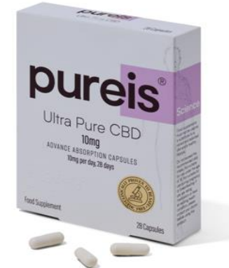
CBD Capsules advanced absorption 10mg 28s