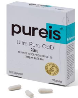
CBD Capsules advanced absorption 20mg 28s