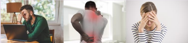
Pain Anxiety Stress